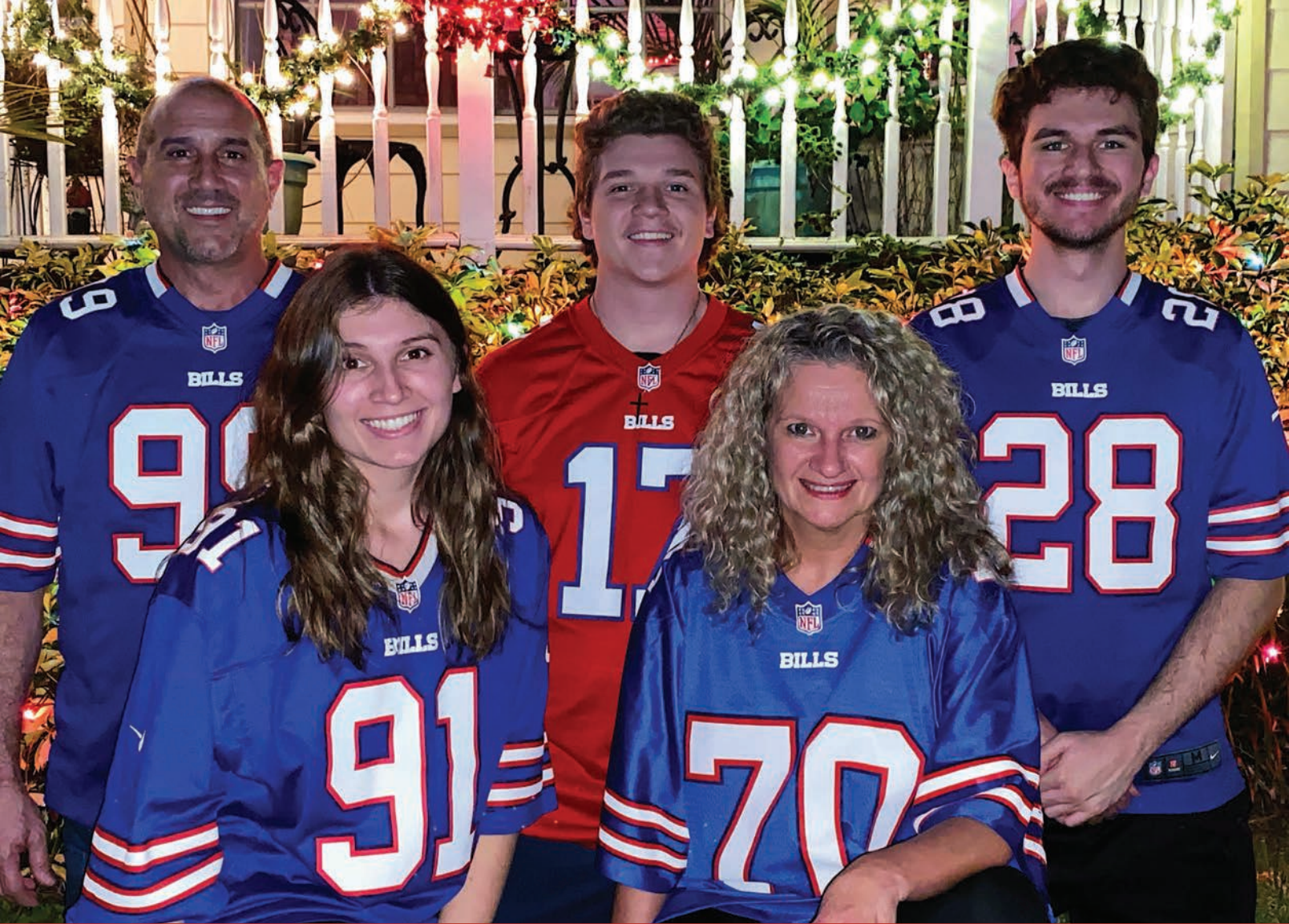
A "Bills Christmas" in 2023.

and choreographing various regional, international and Off-Broadway shows.