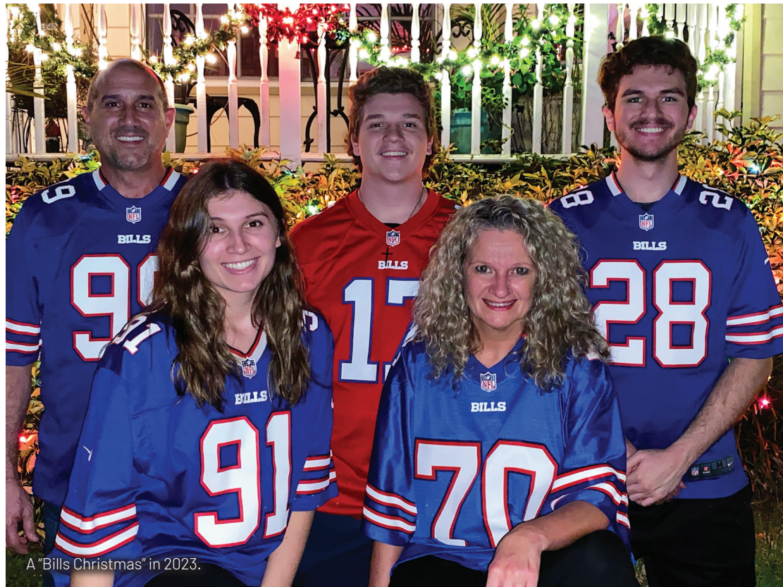
A "Bills Christmas" in 2023.