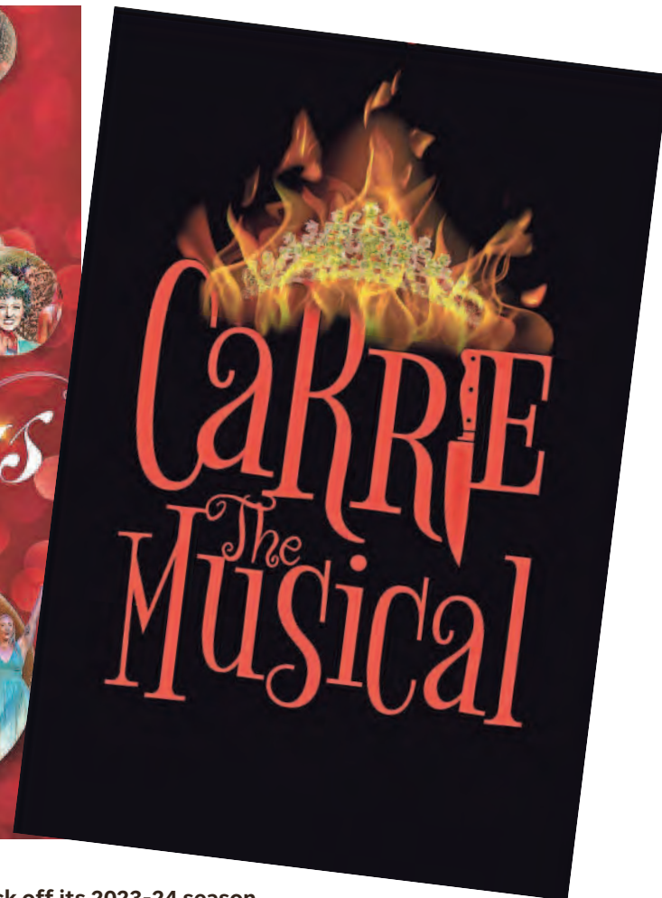
TheatreZone presents “Heathers: The Musical” in October to kick off its 2023-24 season. They will present “Home for the Holidays” in December, and “Carrie: The Musical” will be the final show.