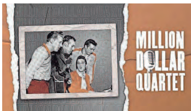
“ Million Dollar Quartet ” is one of the 2023-24 musicals by TheatreZone.