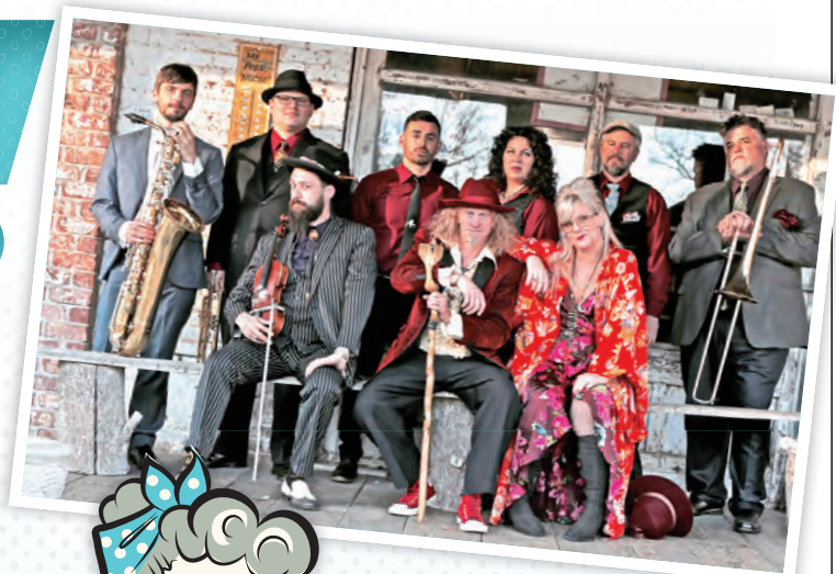
SQUIRREL NUT ZIPPERS / COURTESY PHOTO Squirrel Nut Zippers