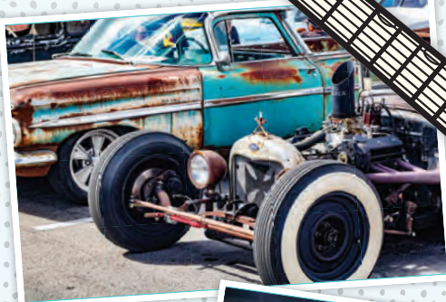
Rockabillaque offers more than music, with car shows and dress up competitions.