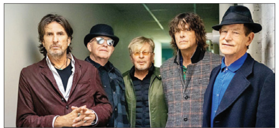
Classic alternative rockers The FIXX is the first event in the free concert series presented by Luminary Hotel & Co. at Caloosa Sound Amphitheater in downtown Ft Myers.

with no additional service charges, but must be claimed in advance at www.CaloosaSoundAmp.com. A limited number of $35 VIP tickets will be available and will include a reserved seat directly in front of the stage (within the first five rows),